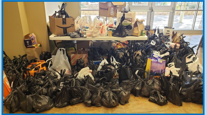
Cuba Mission Trip